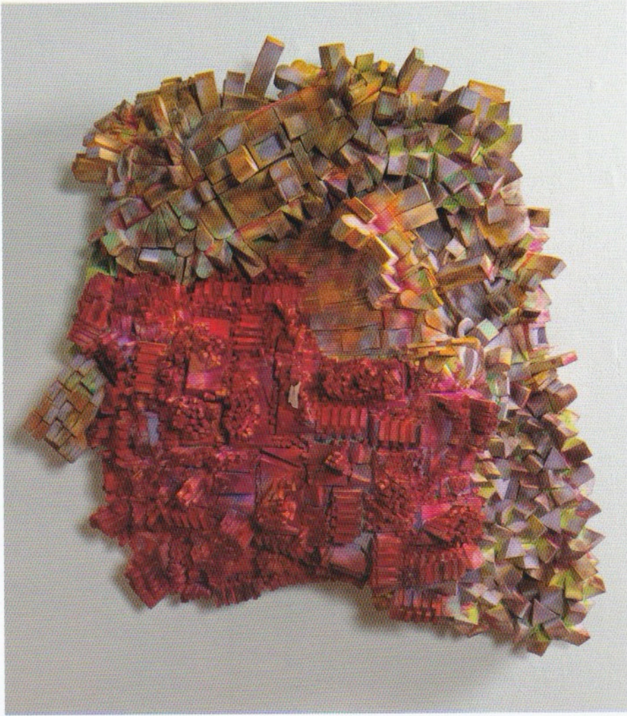
Margery Amdur Accumulations I , hand-cut, manipulated, and sealed miniature foam constructions, ink, gouache, pastel pigment, canvas, 26" x 35", 2013