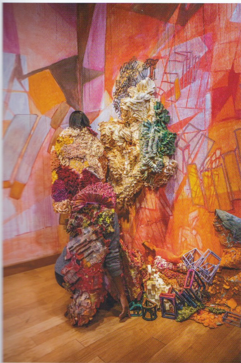
Shades of Green multi-media, dimensions variable